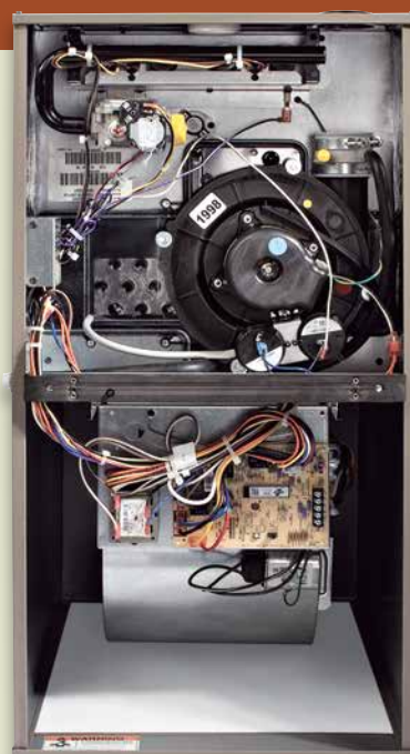
95.5% AFUE model shown

Electronic hot surface ignition saves fuel costs with increased dependability and reliability